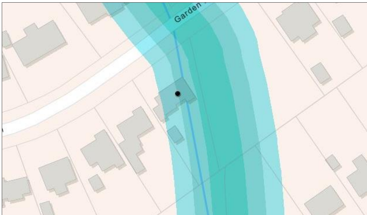
Locational Map with 75'-50'-25' Stream Buffers