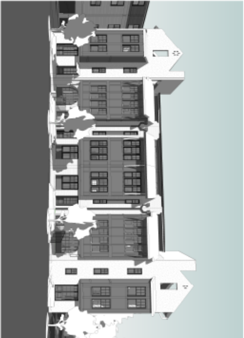
4 EDWARD STREET VIEW