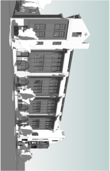
2 CHURCH STREET LOOKING NORTH