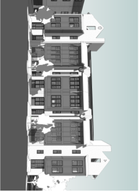
4 HOWARD ELEVATION VIEW