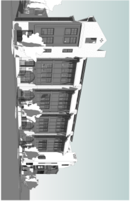
2 CHURCH STREET LOOKING SOUTH