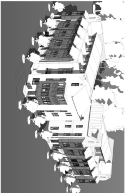
1 AERIAL VIEW