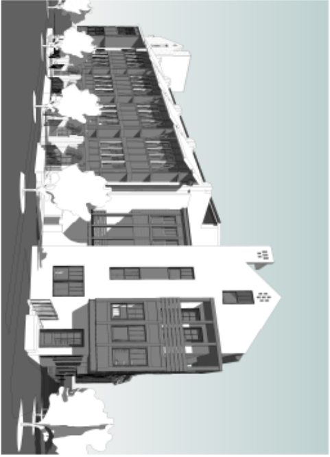
3 HOWARD CORNER