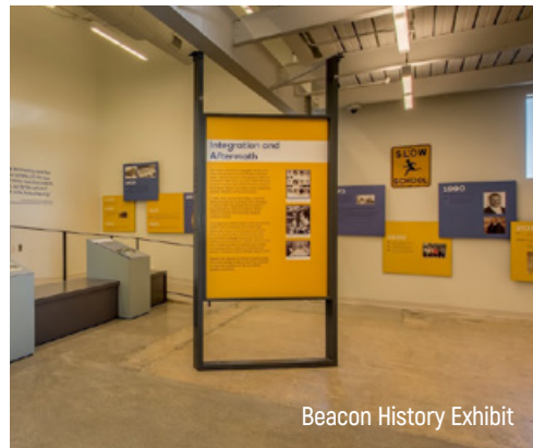
Beacon History Exhibit