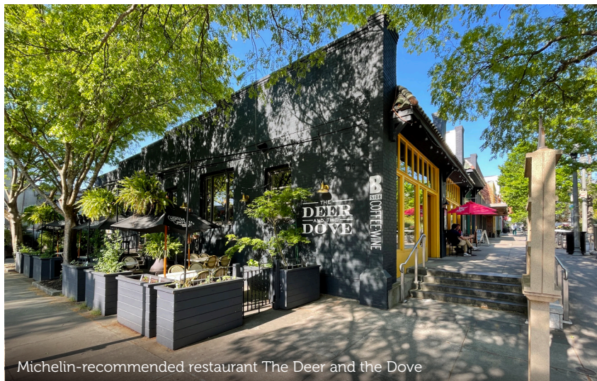
Michelin-recommended restaurant The Deer and the Dove

Just six miles from downtown Atlanta, Decatur is the county seat for DeKalb County and is known for its excellent school system, political and administrative stability, visionary planning and implementation, collaboration with community partners and numerous festivals that are an important part of the fabric of this diverse community. The City is a two-time All-America City award winner, most recently recognized in 2023.