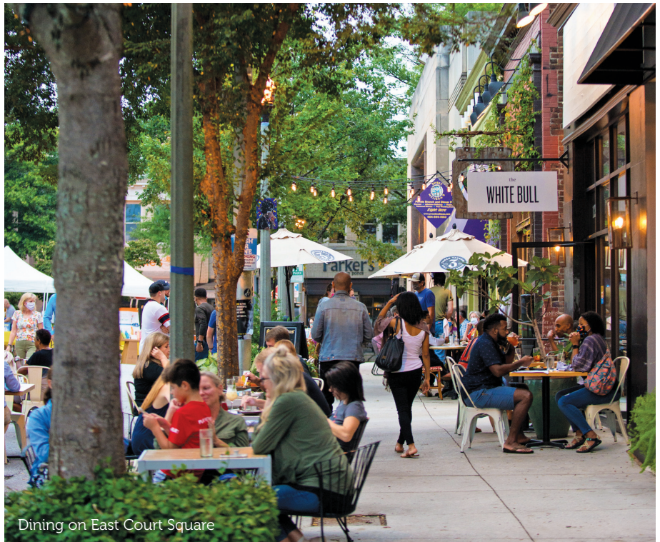
Dining on East Court Square