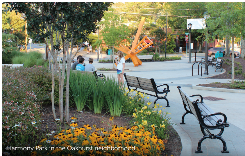
Harmony Park in the Oakhurst neighborhood