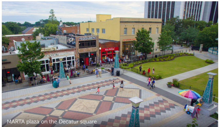
MARTA plaza on the Decatur square

Decatur is a full-service city including police, fire, public works, community and economic development, planning and zoning, finance, human resources, parks and recreation, equity and engagement, and special events. The city has 254 full-time employees, and 202 part-time seasonal employees.