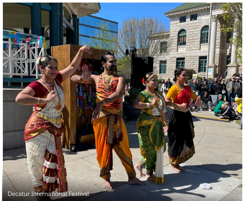
Decatur International Festival