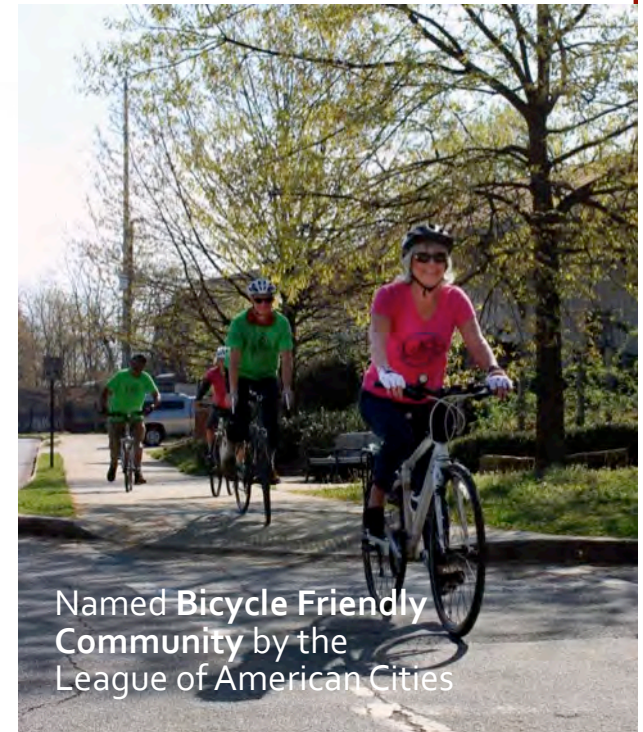
Named Bicycle Friendly Community by the League of American Cities

PEDS Golden Shoe Award 20 Years Strong Superstar Award for investing in walkability