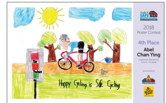
2018 3rd Place poster by Abel Chan Ying